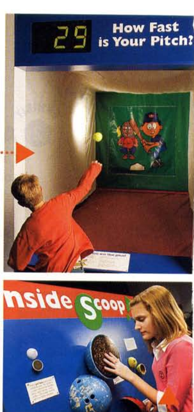
EXHIBIT 1 Team Up! Exploring Science Through Sports

Since this traveling exhibit was in our neck of the woods recently, my family and some friends loaded up a couple of vans with our kids (ages 6 through 15) to check it out. We spent about an hour exploring the show's 15 stations, and we discovered that you don't have to be a scientist or a sports junkie to have a blast. Unlike exhibits that warn "do not touch" or "for eyes only," Team Up! begs for kids to get involved, body and brains. There isn't a single velvet rope in sight. Here, some highlights that make this exhibit a winner.